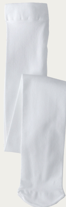
Footed Tights White