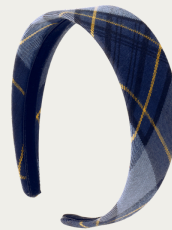
Wide Headband* Classic Navy Plaid (optional)

*Sweater, jumper, skirt, and headband must be purchased through Lands' End. All other dress uniform items may be purchased elsewhere or through Land's End.