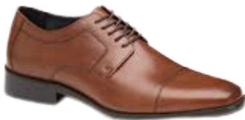
Leather Dress Shoes Black or Brown