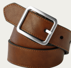
Leather Belt Black or Brown