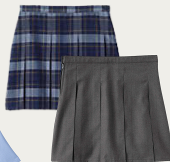
Girls Box Pleat Skirt* Classic Navy Plaid or Gray