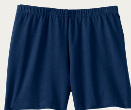
Girls Cartwheel Shorts Navy

*Sweater, jumper, plaid skirt, and headband must be purchased through Lands' End. All other uniform items may be purchased elsewhere or through Land's End.