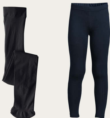
Tights or Leggings Navy or Black