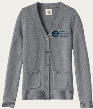
Girls Cotton Modal Button Front Cardigan Sweater* Pewter Heather (logo required)