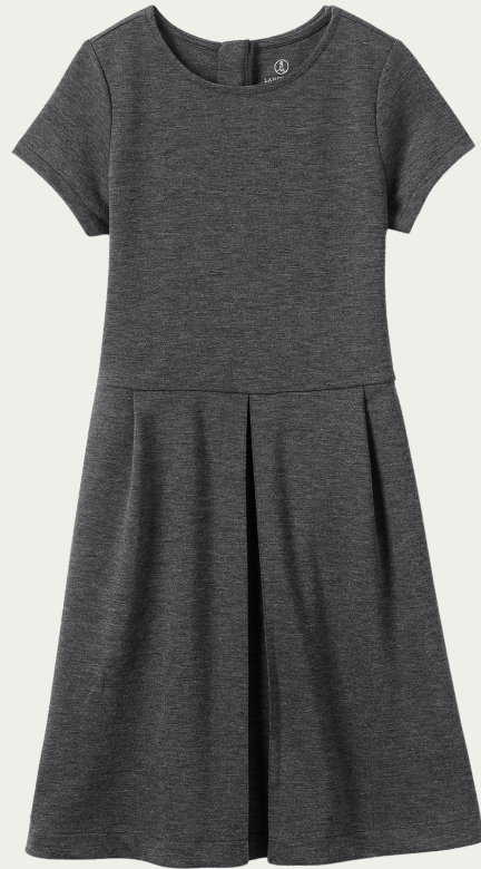
Girls Short Sleeve Ponte Dress* Charcoal Heather