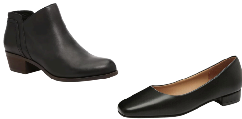
Leather Dress Shoes/Ankle Boots 2" Heel or Less Navy or Black