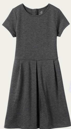
Girls Short Sleeve Ponte Dress* Charcoal Heather