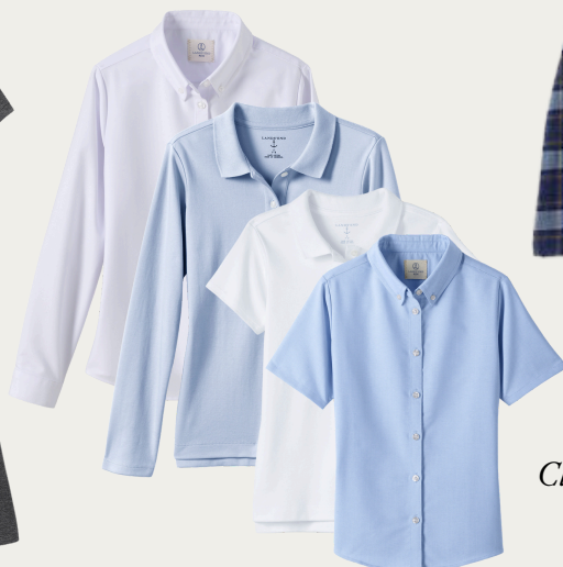
Girls Short or Long Sleeve Oxford or Polo Shirt White or Blue