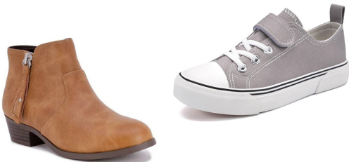
Street Shoes/Flats/Ankle Boots