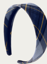
Wide Headband* Classic Navy Plaid