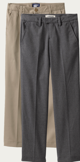
Girls Chino Pants Gray (7-12) or Khaki (9-12 only)