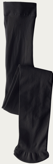
Tights Navy or Black