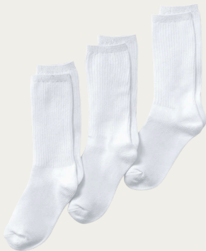
Crew Socks White