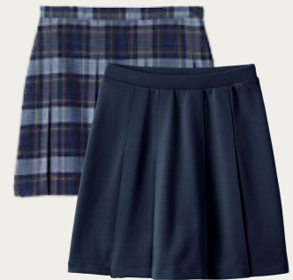
Girls Box Pleat Skirt* Girls Ponte Pleat Skirt Classic Navy Plaid or Navy