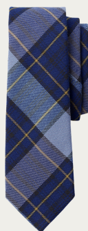
Tie* Classic Navy Plaid