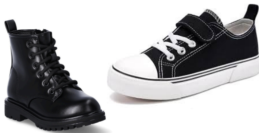
No Cloth No Boots