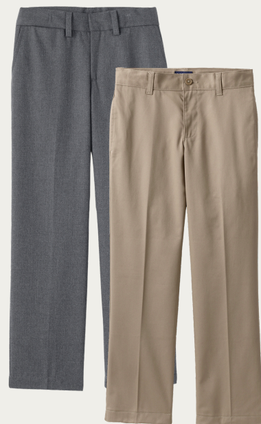
Boys Plain Front Chino Pants Gray (7-12)** or Khaki (9-12 only)