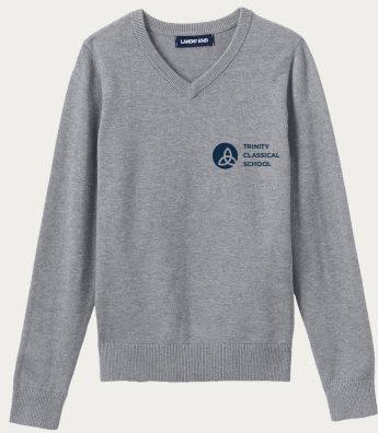
Boys Cotton Modal Fine Gauge V-neck Sweater* Pewter Heather (logo required)