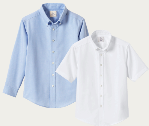
Boys Long or Short Sleeve Oxford Shirt White or Blue