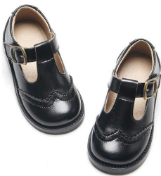
Leather Dress Shoes/Ankle Boots Brown or Black