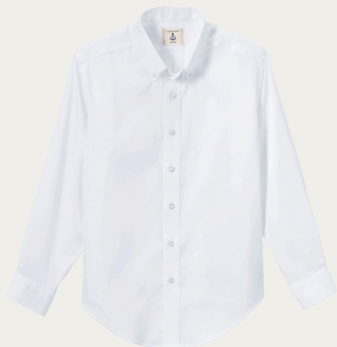
Boys Long-Sleeve Oxford Shirt White