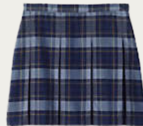
Girls Plaid Box Pleat Skirt* Classic Navy Plaid