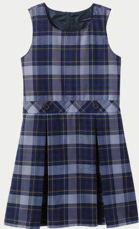
Girl's Plaid Jumper* Classic Navy Plaid