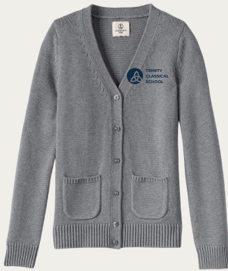
Girls Cotton Modal Button Front Cardigan Sweater* Pewter Heather (logo required)