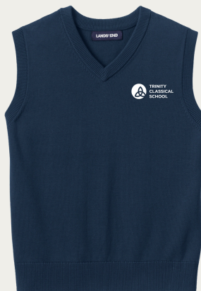
Boys Cotton Modal Fine Gauge Sweater Vest* Classic Navy (logo required)