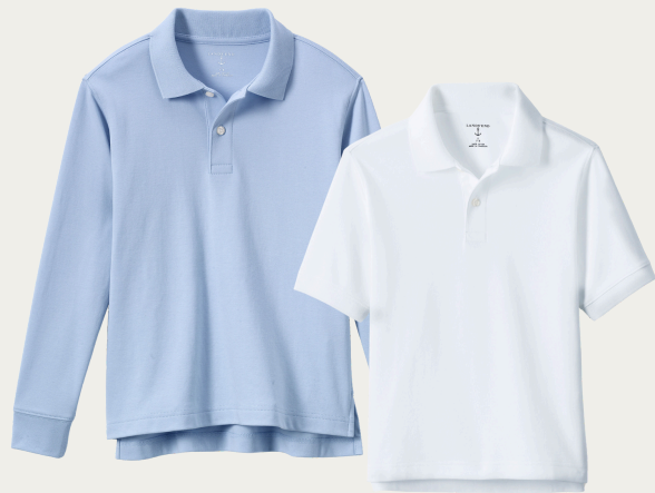
Boys Long or Short Sleeve Polo Shirt White or Blue