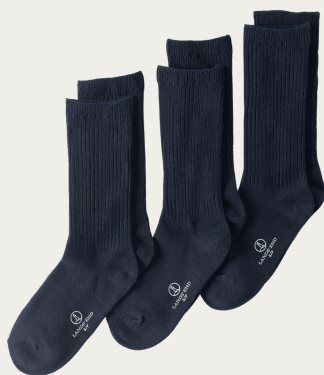
Crew Socks Black or Navy