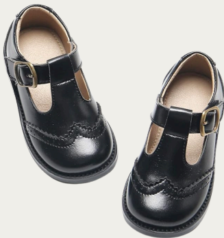
Dress Shoes Navy or Black