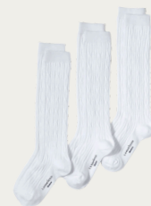
Knee Socks White