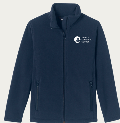
Full-Zip Mid-Weight Fleece Jacket* Classic Navy (logo required)