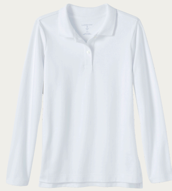
Girls Long Sleeve Polo Shirt White