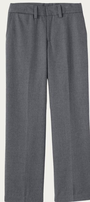
Boys Plain Front Chino Pants** Gray