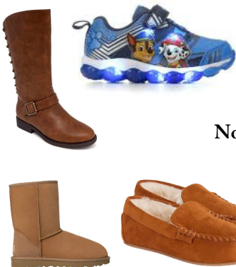
No slippers No Uggs, No Knee high boots No Light-Up/ wheels/etc.