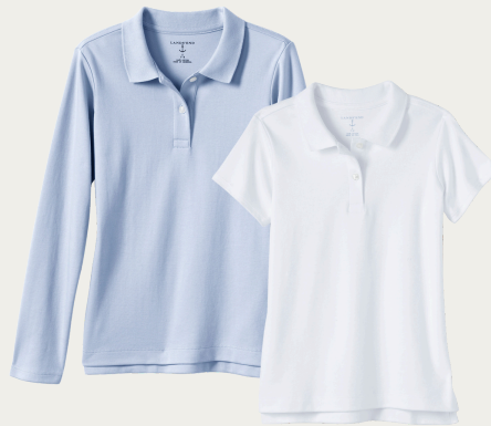
Girls Short or Long Sleeve Polo Shirt White or Blue