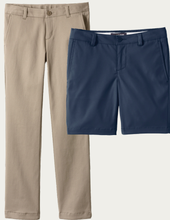
Girls Chino Pants and Shorts Navy and Khaki