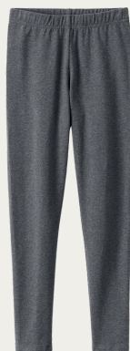
Girls Legging Charcoal Heather