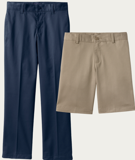
Boys Plain Front Chino Pants or Shorts Navy or Khaki