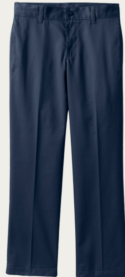
Boys Plain Front Chino Pants Classic Navy