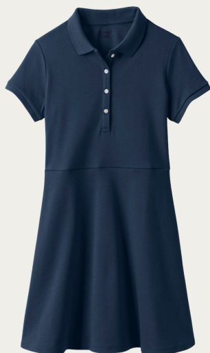
Girls Short Sleeve Interlock Polo Dress Classic Navy