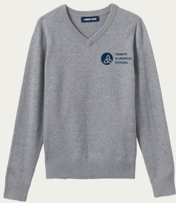
Boys Cotton Modal Fine Gauge V-neck Sweater* Pewter Heather (logo required)