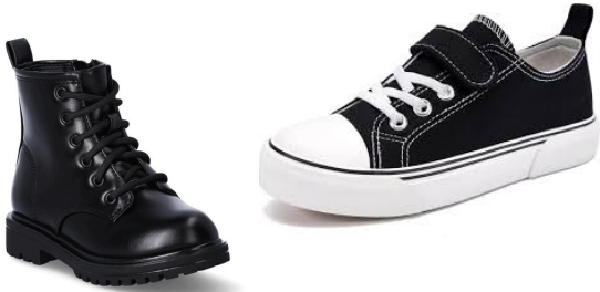
No Cloth No Boots