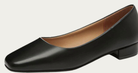
Dress Shoes Navy or Black

*Sweater and dress must be purchased through Lands' End. All other dress uniform items may be purchased elsewhere or through Land's End.