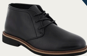
Dress Shoes Brown or Black

*Sweater, vest, and tie must be purchased through Lands' End. All other dress uniform items may be purchased elsewhere or through Land's End.