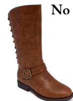
No slippers No Uggs, No Knee high boots No open-toed shoes