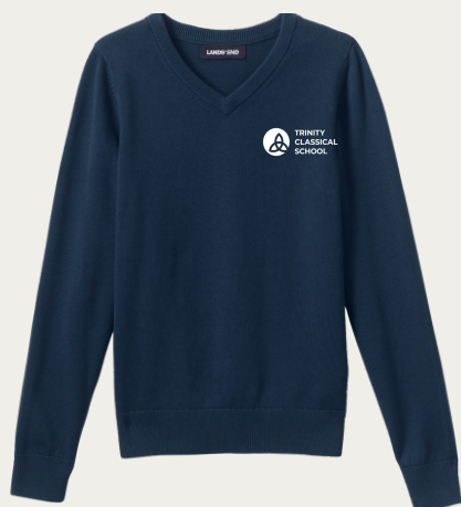
Boys Cotton Modal Fine Gauge V-neck Sweater* Classic Navy (logo required)