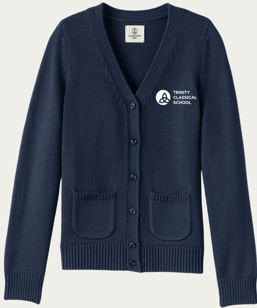
Girls Cotton Modal Button Front Cardigan Sweater* Classic Navy (logo required)