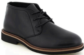
Leather Dress Shoes Black or Brown