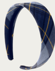
Wide Headband* Classic Navy Plaid