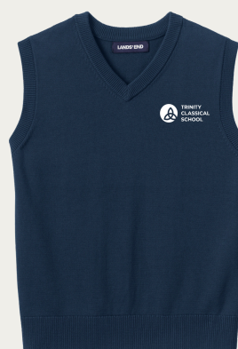
Boys Cotton Modal Fine Gauge Sweater Vest* Classic Navy (logo required)